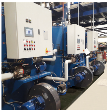
3 x 2000 kg/h Units