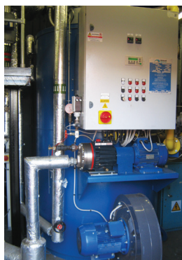
1500 kg/h Unit