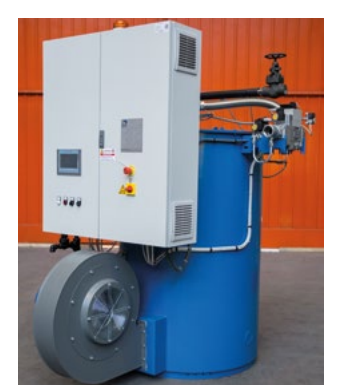
1200 kg/h Unit