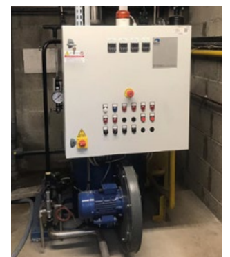
600 kg/h Unit